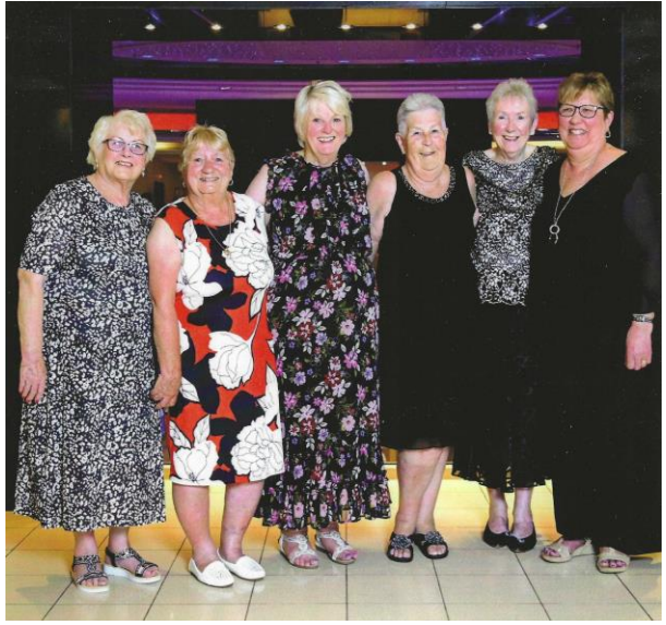
The merry u3a widows cruising the Canaries. A good time was had by all!