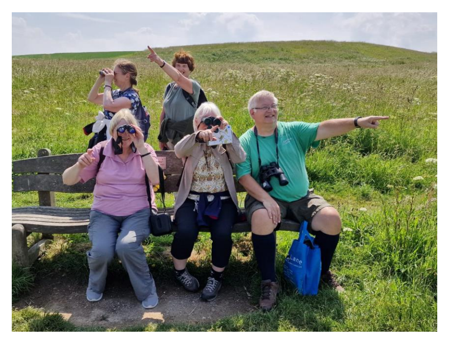
The Naturewatch team out on Safari, they have spotted something, but they are not sure what or where!