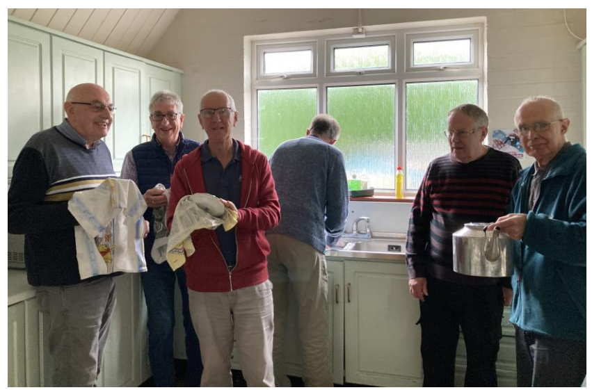
Nothing to this kitchen lark, we don't know what the fuss is all about! (don't tell the wife I said that)