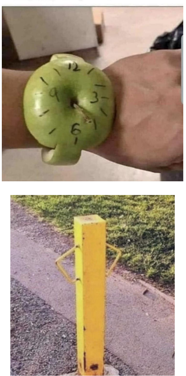
That's an angry looking post

Apple watch for sale, hardly used, used to belong to my Granny Smith.