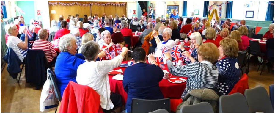
The 'Massed' Celebration for the Coronation