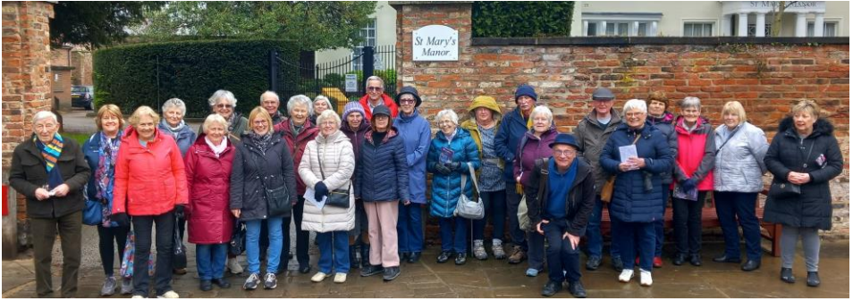
The Paul Schofield Walk in Beverley