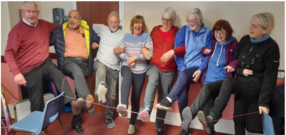
Tighrope walking at Circus Skills!