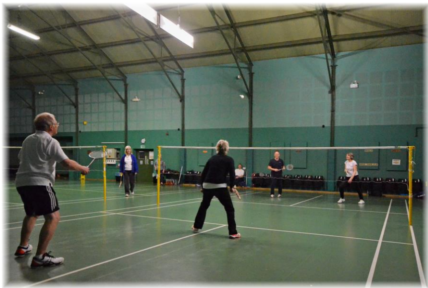
The Badminton Group in action (for further information see Page 5)