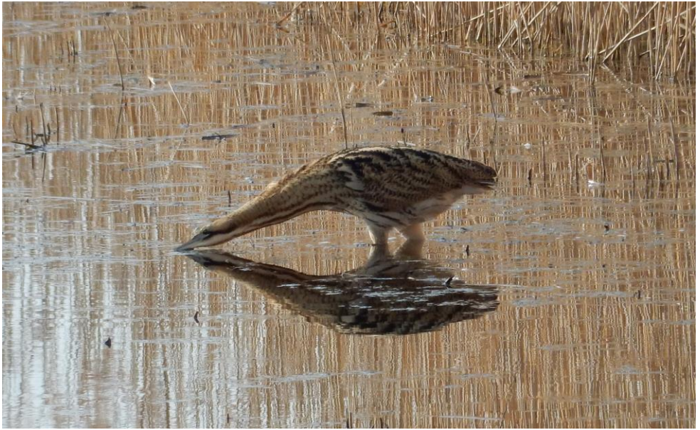
Photos taken on the Naturewatch visit to Far Ings Nature Reserve