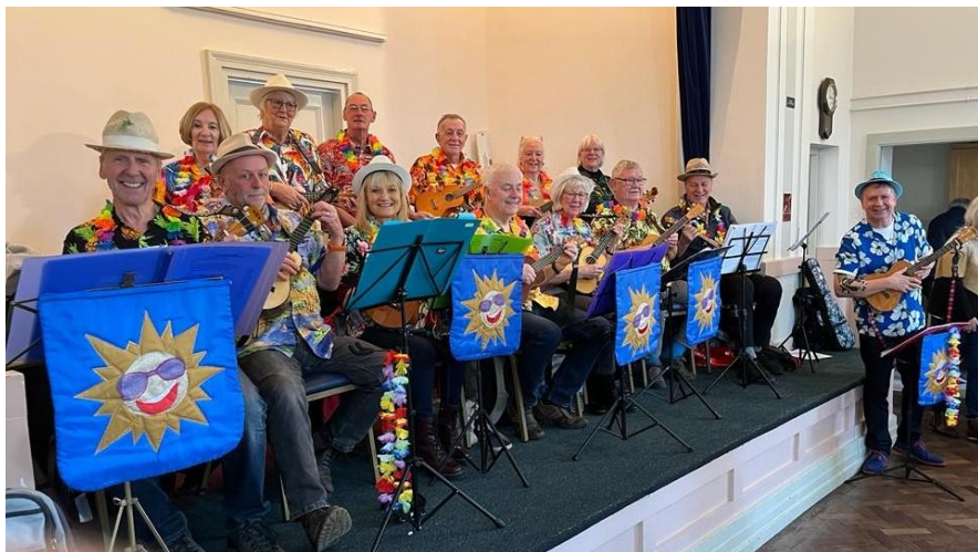
No stage fright for the Sunshine Strummers at Charterhouse, Hull