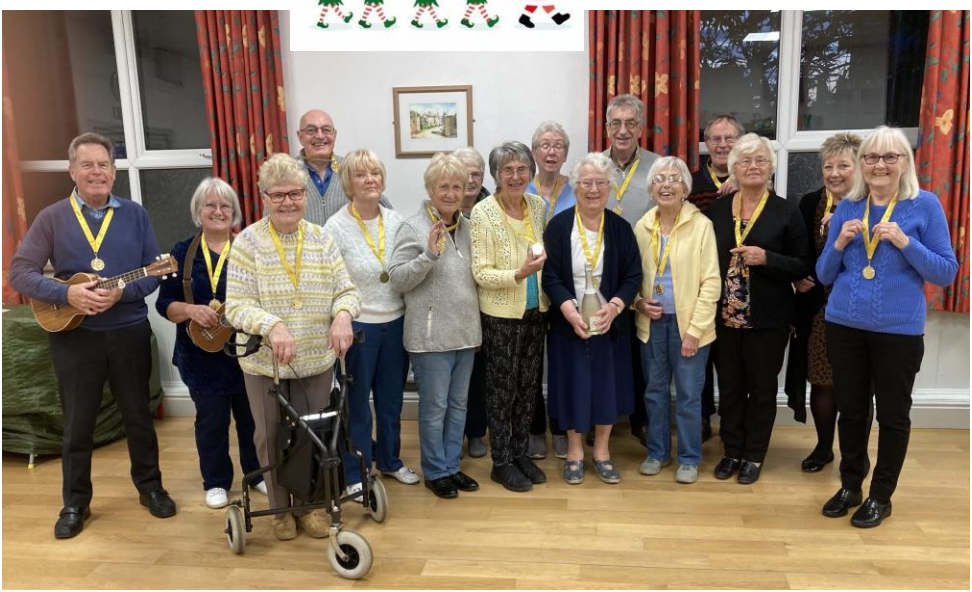
The Wide AWAKE singing group, Runners up in the celebrating talent competition at Cottingham Civic Hall