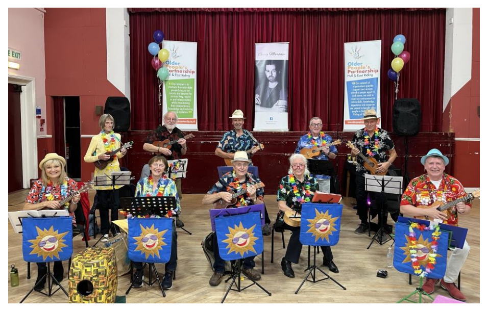
The Sunshine Strummers at the Hessle Town Hall

The Barely Awake Ukes whipping the Willerby Wives into a frenzy!