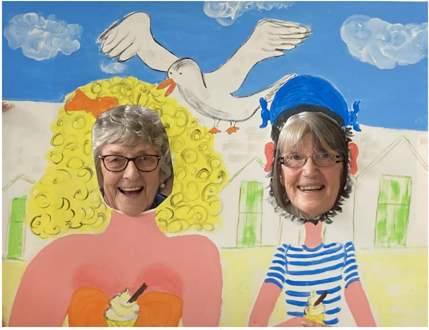
More Jollity at the u3a 40<sup>th</sup> anniversary celebration