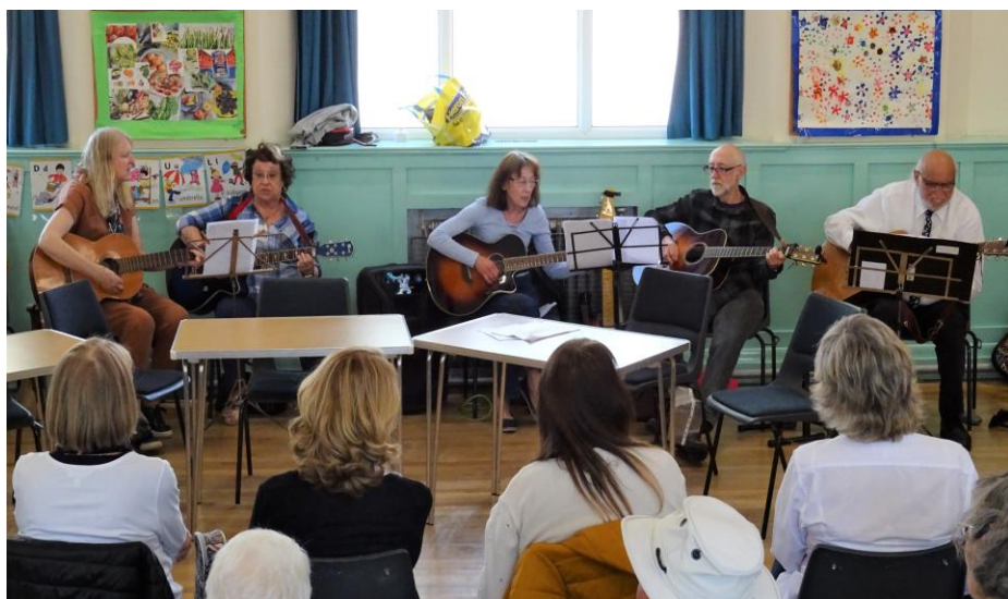
Is it the Beatles or our Guitar Group