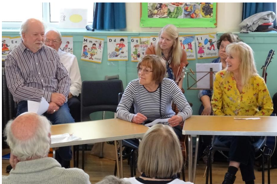
The French Quiz in action