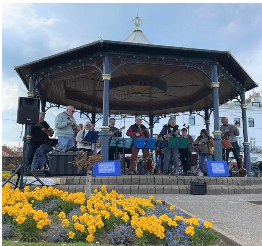
Barely Awake rocking in the Bandstand at the Filey Folk Festival