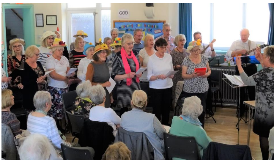
The Singing Group in fine voice