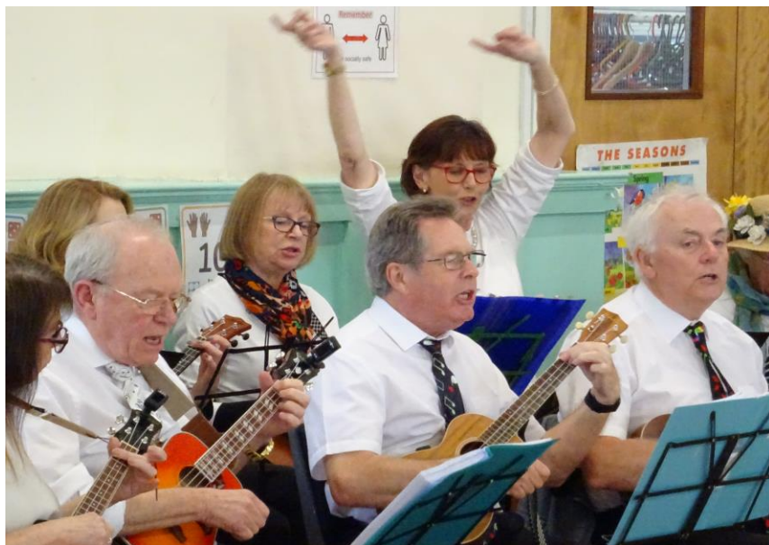
Barely Awake in animated full strum