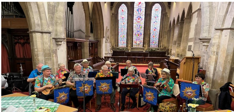
Sunshine Strummers in the grand surroundings of the St. Andrews Church, Kirk Ella