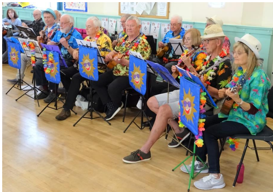
The very colourful Sunshine Strummers