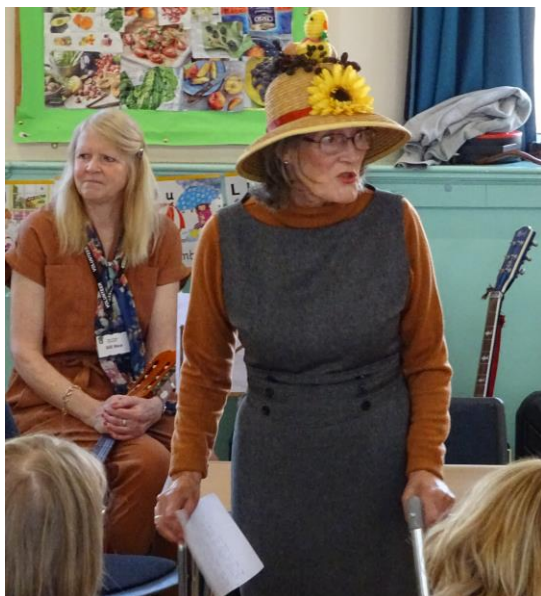
She cannot be 91!