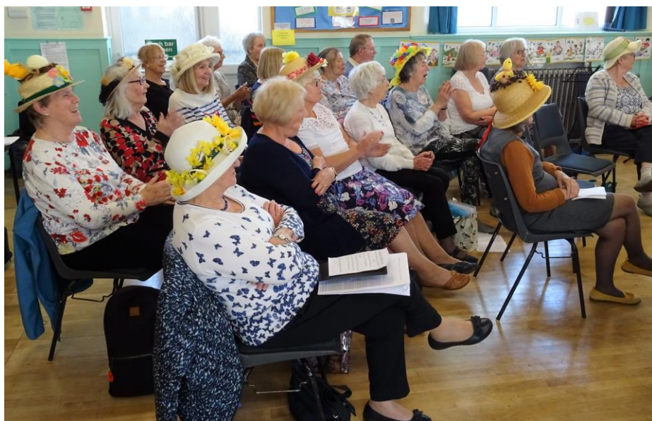
Some of the Easter Bonnets on show