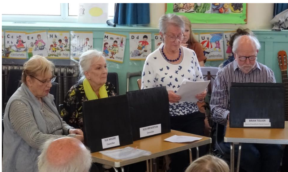
The Play Reading 'Councillors' in action