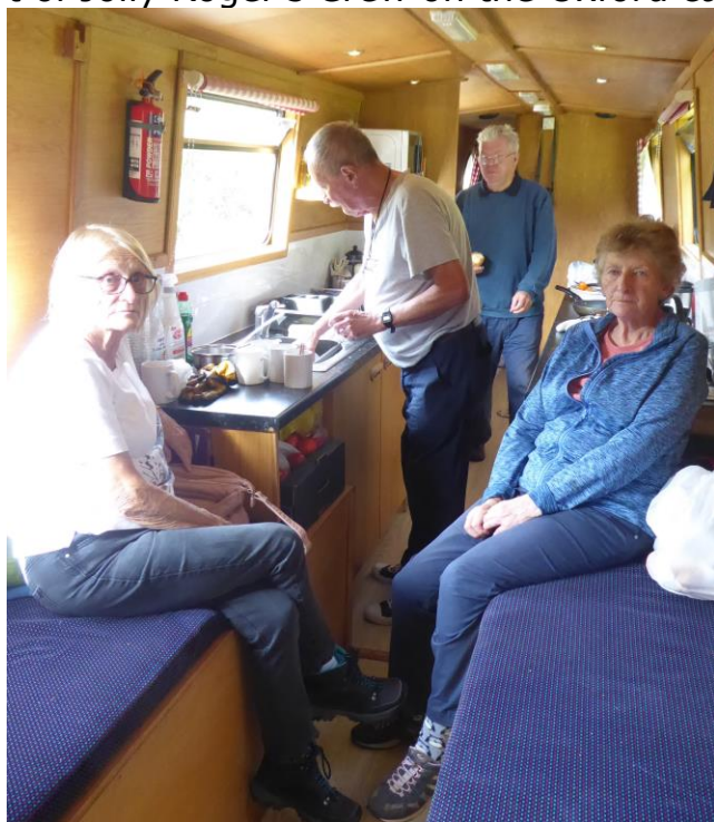
Cheer up Girls, the lads are on Pot duty