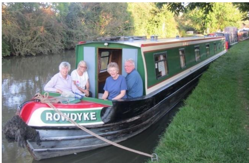
Part of Jolly Roger's Crew on the Oxford canal