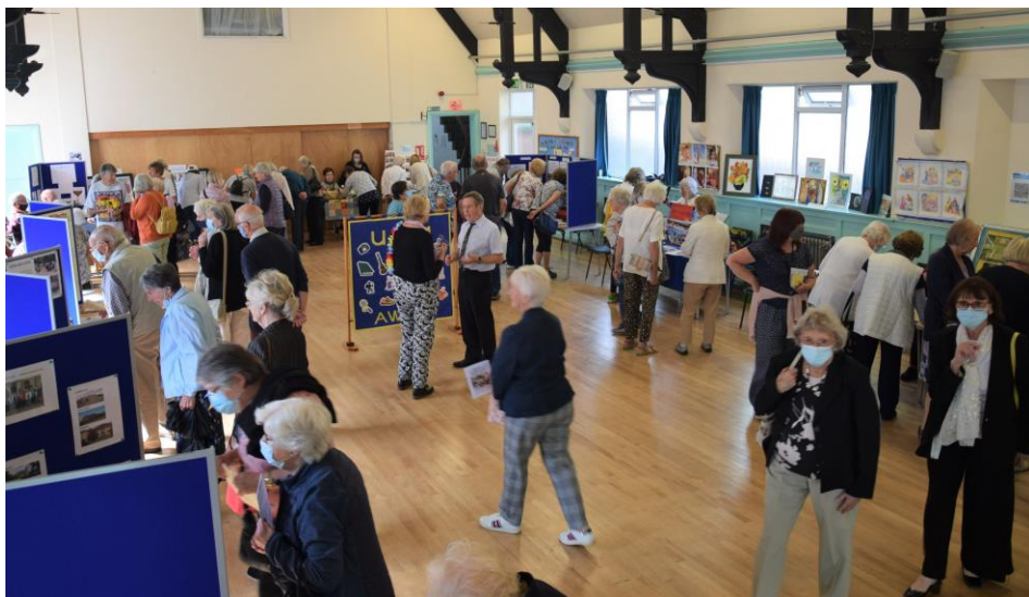
Open Day indoor Group information stalls