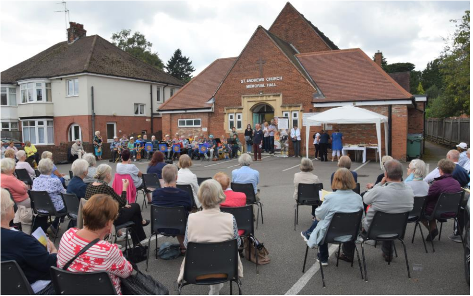
Open Day speeches and entertainment