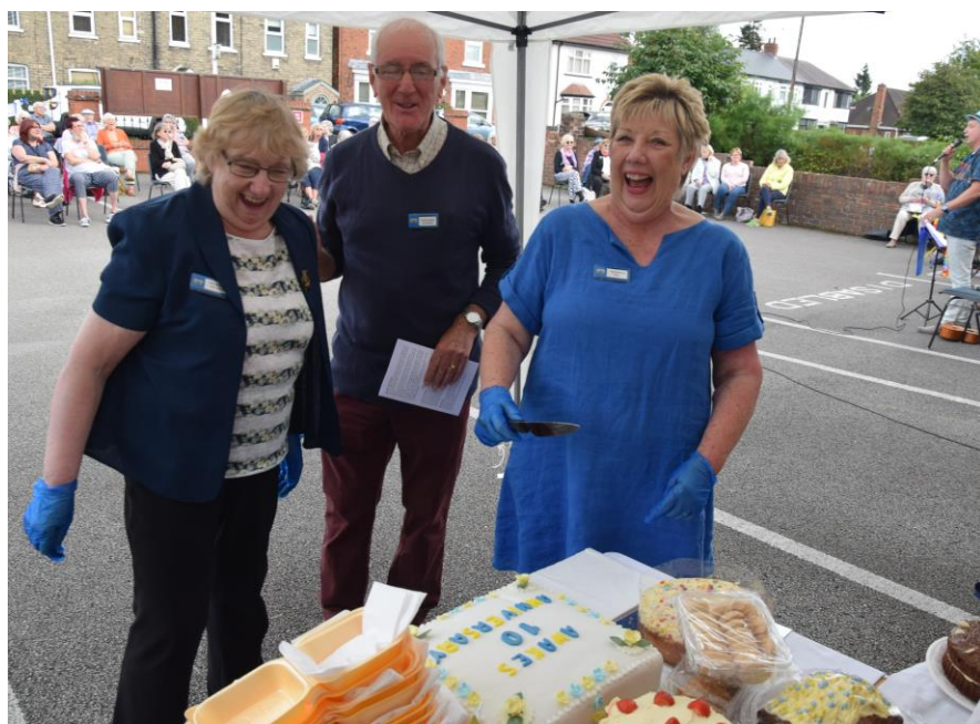
Current & past Chairs sharing a joke at the Open Day