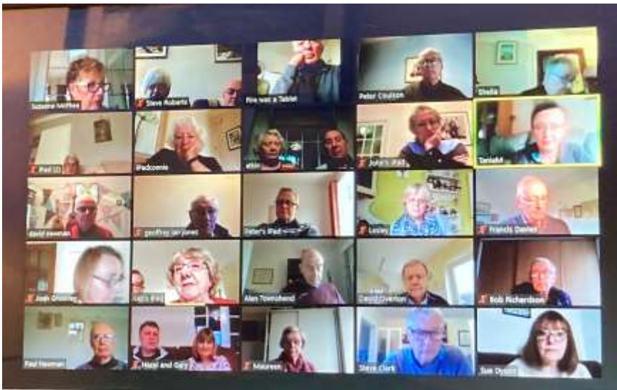
A selection of the Zoom AGM participants