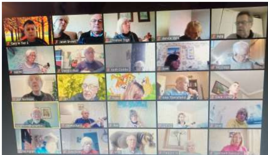
A selection of the Uke players enjoying The 'Animals' themed Big Bash