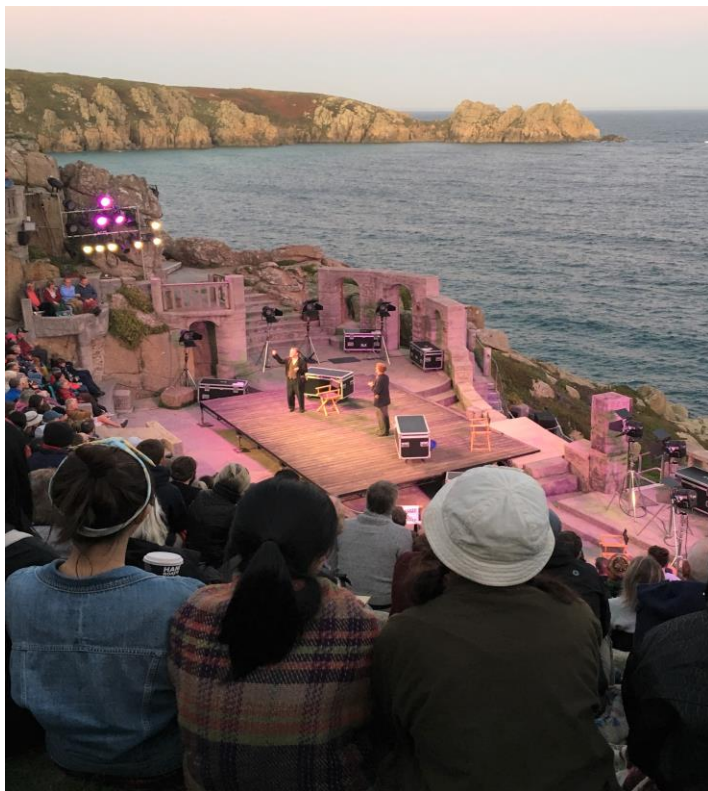
The St Ives 'Caravan' visit to the Minack Theatre in Cornwall