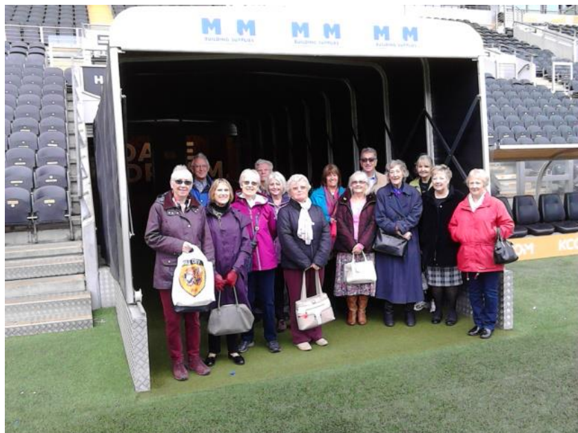
Hull City's new signings trot out of the tunnel at the KCOM Stadium