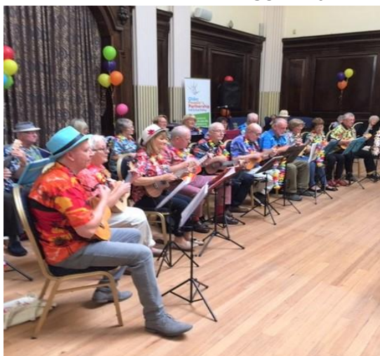
The Sunshine Strummers at the Hull Guildhall helping to celebrate the achievements of those of a certain age!