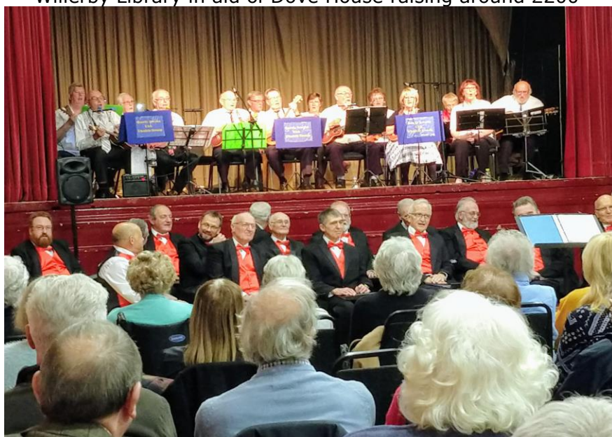
Barely Awake and the Hull Male Voice Choir at Hessle Town Hall