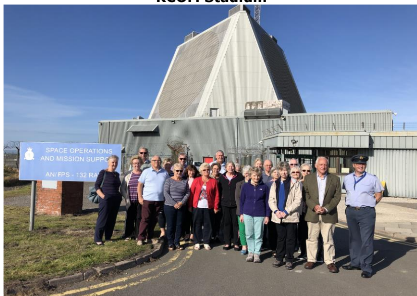
The first U3A would be astronauts in training at Fylingdales for their maiden flight in space