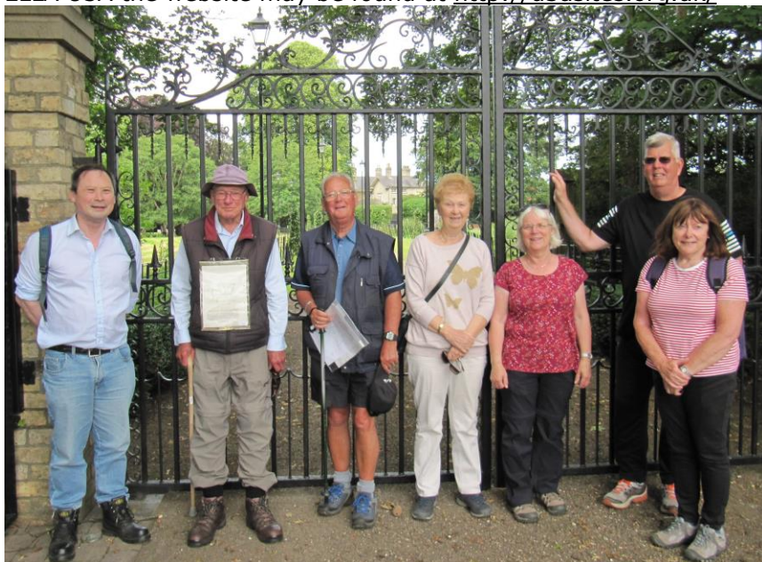
The Short Walking Group at North Cave

Registered Charity Number 1150988 ANLABY WILLERBY AND KIRK ELLA U3A the website may be found at http://u3asites.org.uk/