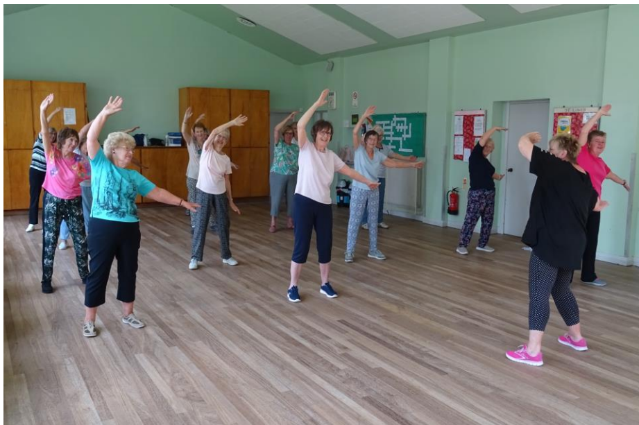
The Flex and Stretch Group in ACTION