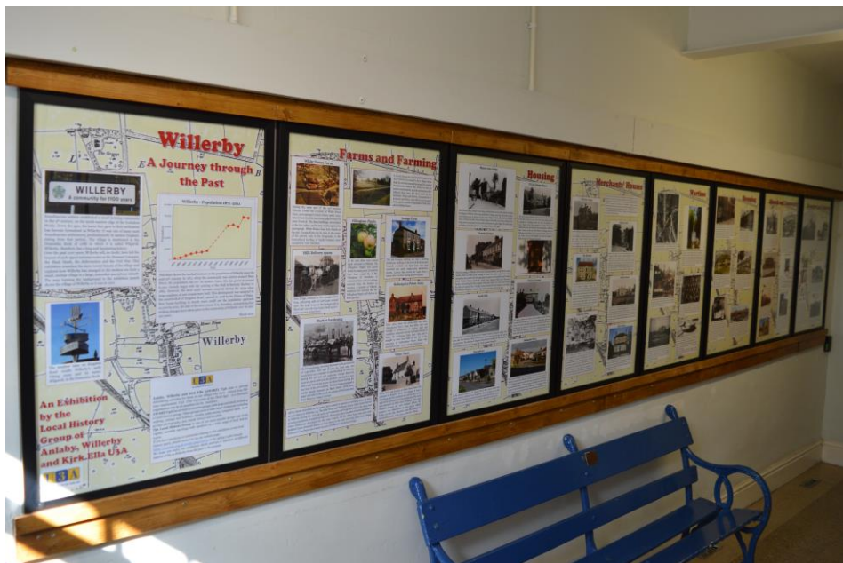
The new Willerby History boards in the Library provided by our Local History Group