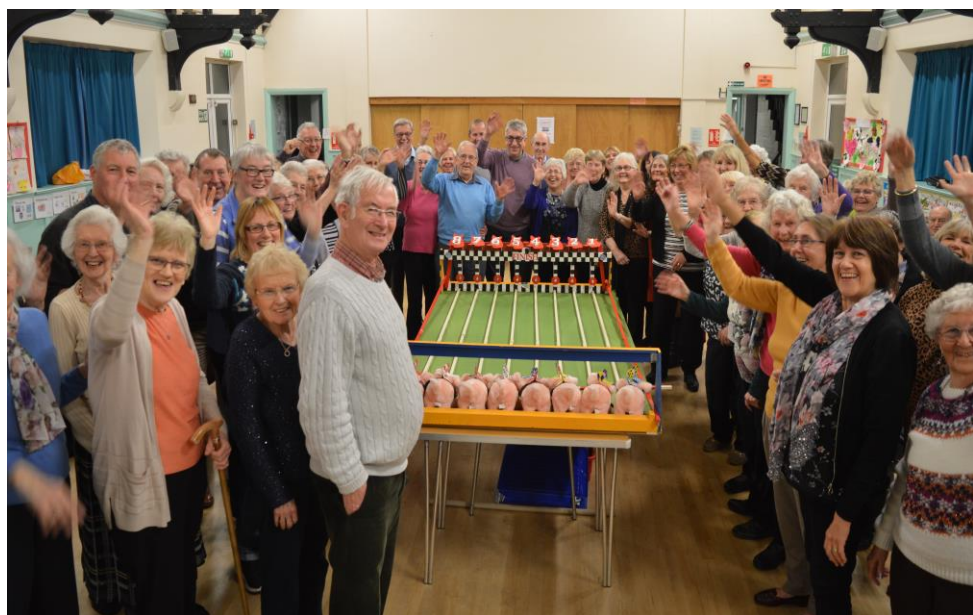
The excited U3A Punters at the start of the Piggy Gold Cup