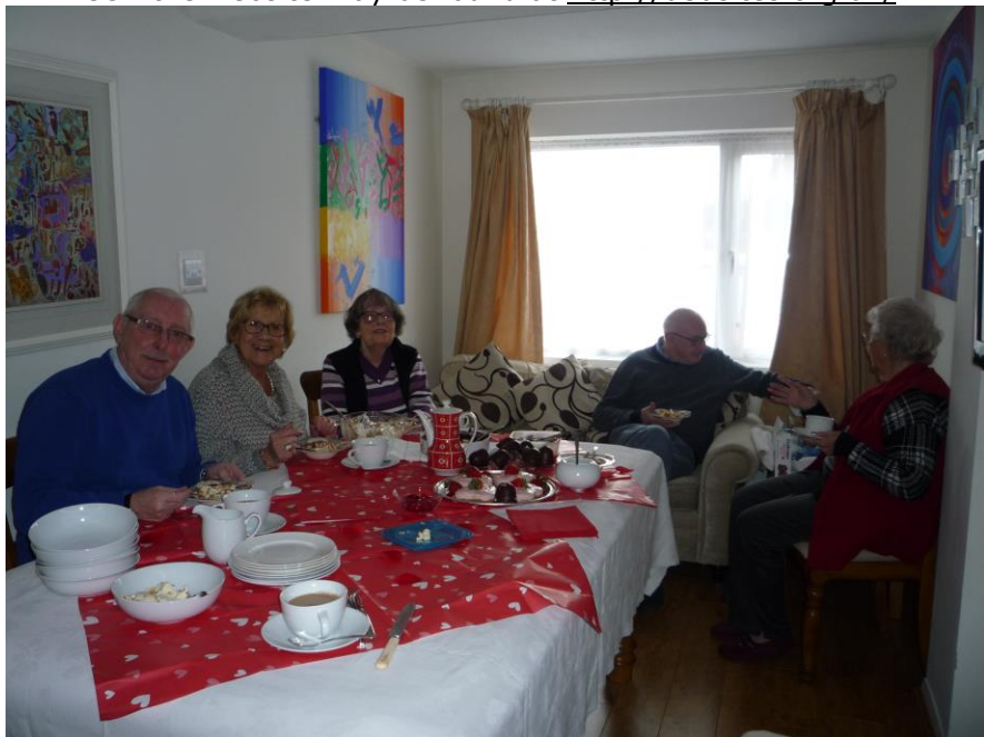
The Pudding Club celebrating Valentine's day

Registered Charity Number 1150988 ANLABY WILLERBY AND KIRK ELLA U3A the website may be found at http://u3asites.org.uk/