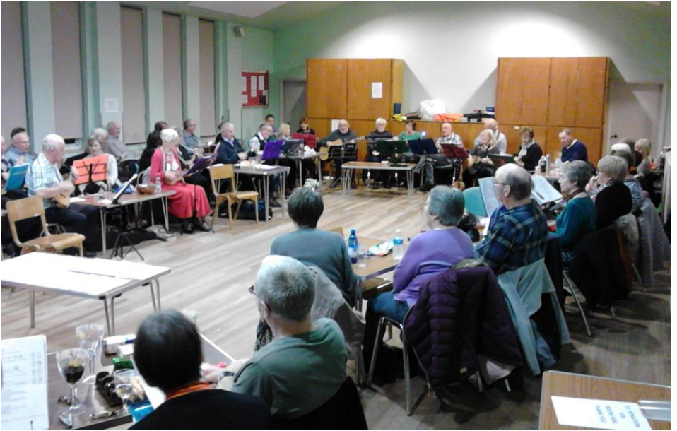
The Ukulele Groups social evening at St. Luke's Church