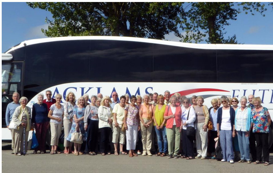
The Stately Homes Group Visit to Norfolk