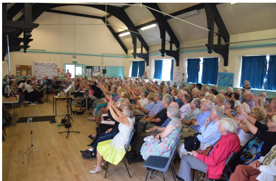
175 members rocking to Sweet Caroline