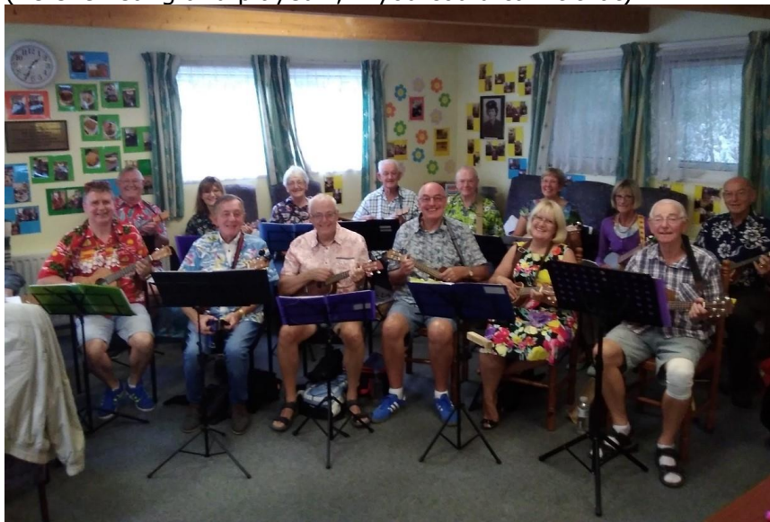
The Sunshine Strummers (alias the Ukulele intermediate group) enjoying their very first Gig at the Anlaby Care Centre!