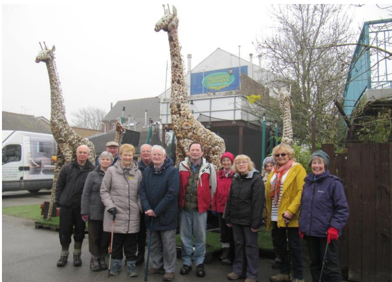
The Short Walks Group at what looks like a zoo but was actually the Fireplace shop near Darley's Arms!