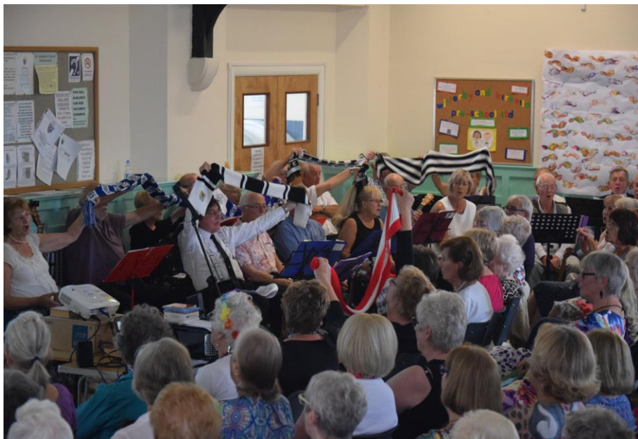
You'll never walk alone with U3A