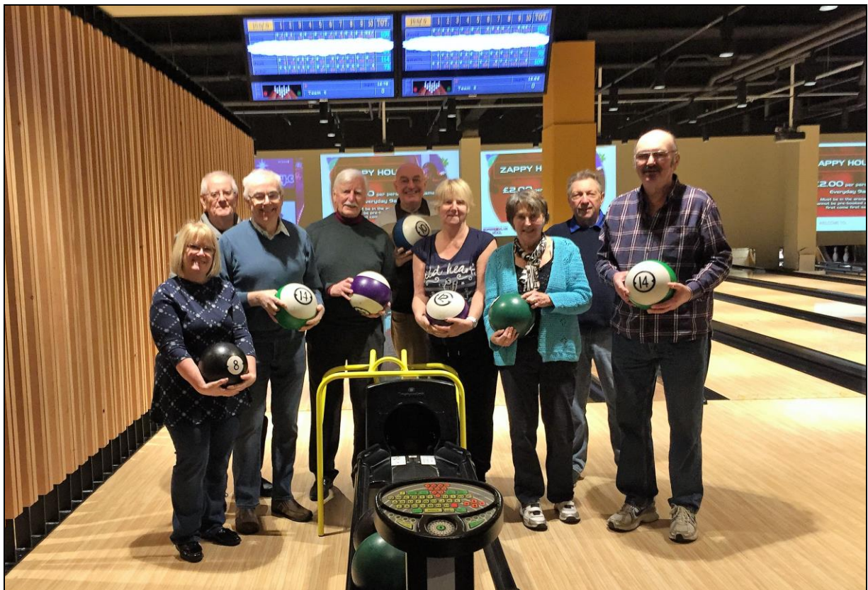
The happy bowlers at the very first outing for the new Ten Pin Bowling Group.