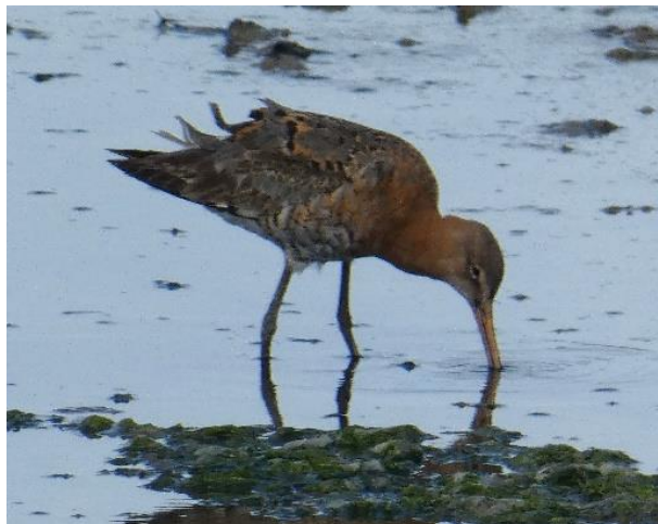
A rather scruffy Black-tailed Godwit