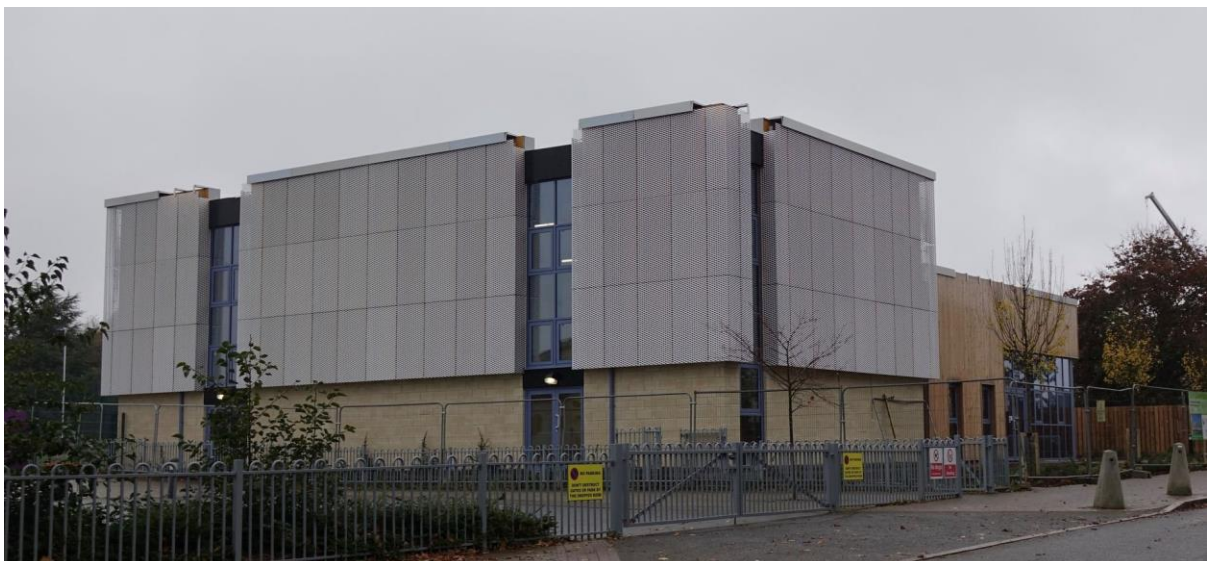
Exterior view of the Chestnut Hall from Repton Avenue

Repton Connect Community Centre, Repton Avenue, Ashford, Kent TN23 3RX