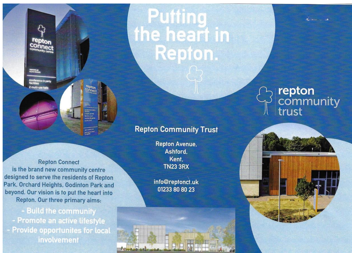
The Repton Community Trust leaflet