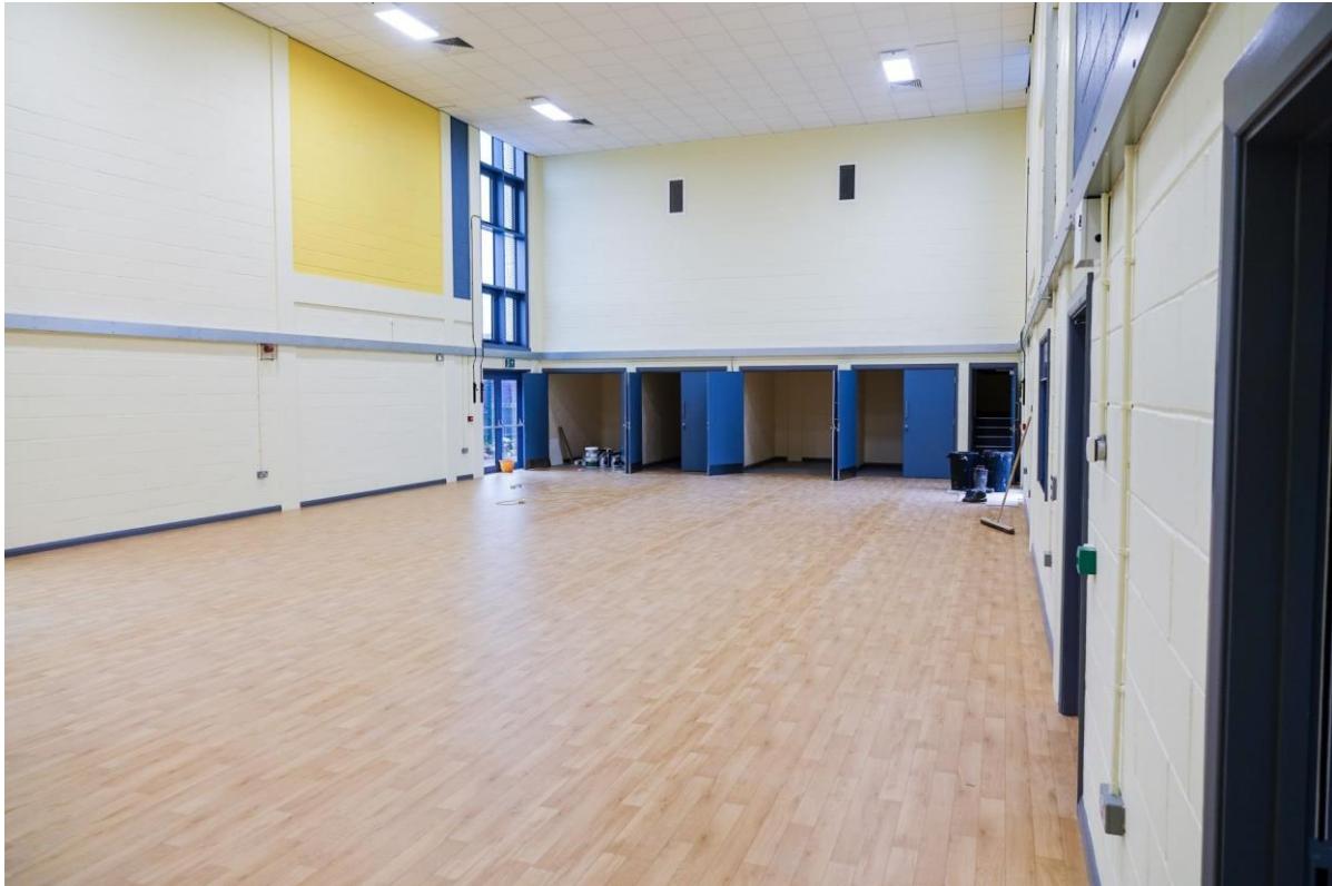
Interior view of the Chestnut Hall (during construction)

Later in springtime, there will be an integral projector screen and projector so that speakers will have perfect imaging to support their talks.