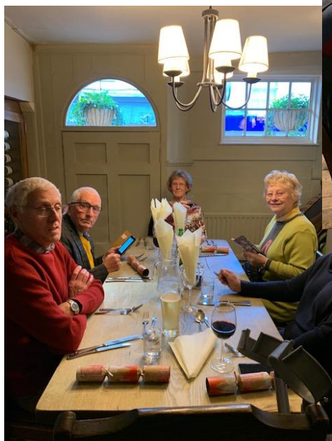
Lunch underway at the Sun Inn Faversham

We had reserved the lower floor so that we could all enjoy a meal together. The food was excellent and the service friendly so by the time we had to re-join the coach for our short journey into Canterbury we were feeling full and happy – and fighting hard not to nod off!