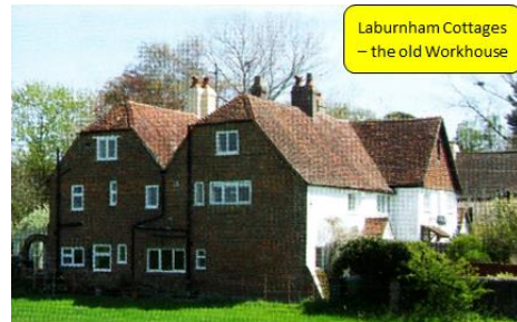
Laburnum Cottages – the old Workhouse

she lives at Laburnum Cottages in Yapton which was the village workhouse – see photograph.